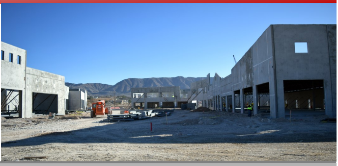
Tornillo Manny F. Aguilera Highway *Dan Williams Construction

La Villita: We are continuing work on TXDOT ROW, paved deceleration lanes, and will begin all concrete site work. We have begun laying base course in three separate areas and will start to work on the curb adjacent to the concrete pavement.