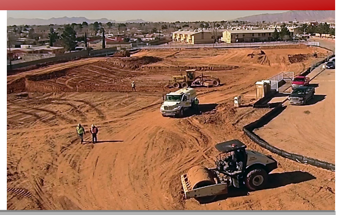
Montecillo 4A * EPT Mesa Development

Haymon Krupp Apartments: ZTEX is to complete all civil work including utilities, earthwork, paving, and concrete. Completed 80% of over-excavation operations.