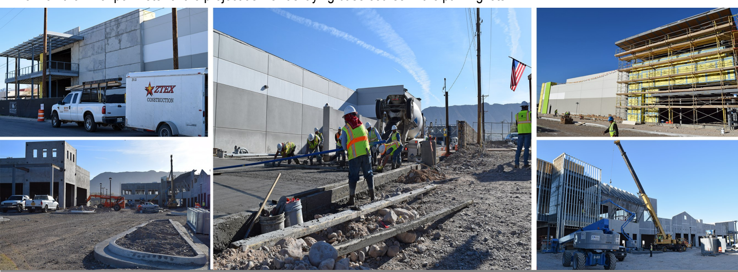
Manny F. Aguilera Highway * Dan Williams Construction

La Villita: We are continuing work on TXDOT Right of Way with sidewalks and ramps; currently working on the curb and gutter work on the inner perimeter of the project as well as laying base course in the parking lots.