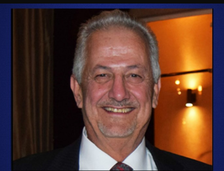
October 17th was National Boss's Day. Because of all three of you, our workplace feels like a community! Thank you from all of us! HAPPY BOSS'S DAY!